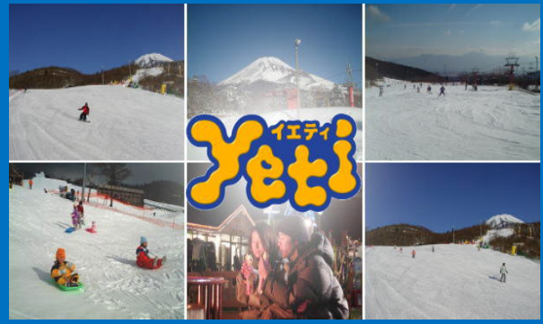
( Located just 30 minutes from Camp Fuji)